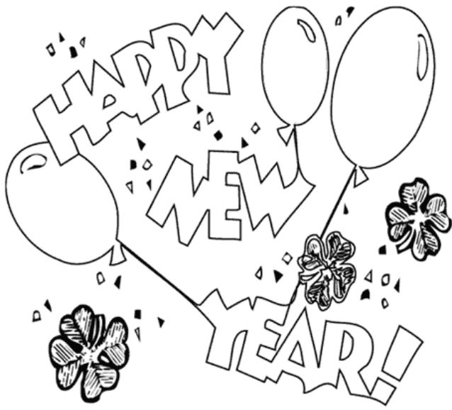
A New Year picture for you to colour

Which weighs more a ton of feathers or a ton of bricks?